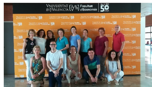
1 st interim meeting in Valencia